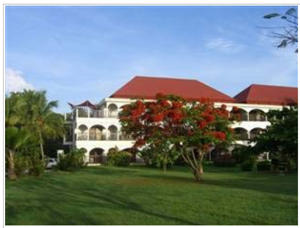
Tranquility Bay, Antigua.

That's key, of course. You certainly don't want to be surrounded by other people's kids. Join forces with friends and split the costs.